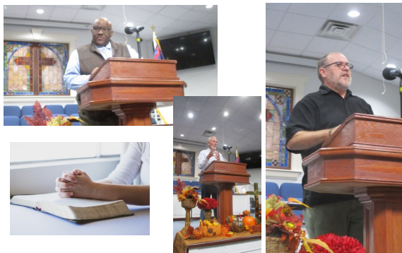
ABOVE: Speakers at our Community Wide Prayer Event prior to the 2024 Election to pray for our Country, Our leaders and each other.