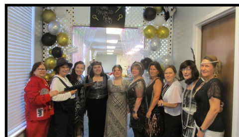
ROARING 20s Event—FUN Times with the costumes!! Ladies of SBC