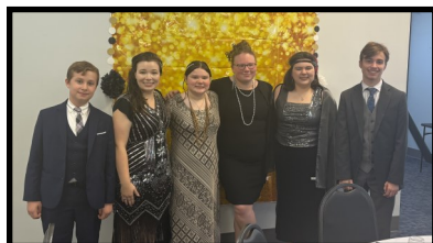
ROARING 20s Event—GREAT JOB from our Youth and the wonderful Director we have!! Thank you for all you do! Great Planning!! We know it was a lot of work